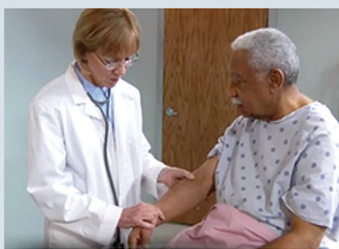
1.4. The Skin (1:30)