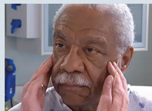
1.6. Nervous System: Cranial Nerves (3:31)