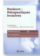
Douleurs: thérapeutiques invasives