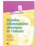
Maladies inflammatoires chroniques de l'intestin