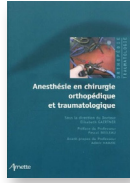
Anesthésie en chirurgie orthopédique et traumatologique