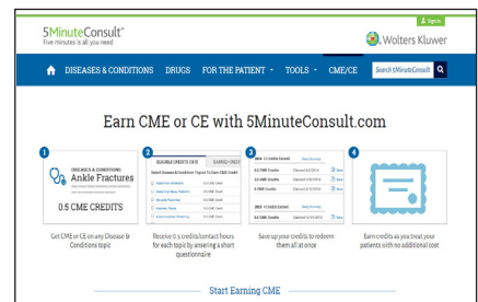
MyCME or MyCE portal on 5MinuteConsult.com